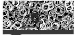
Pop Tab Challenge Pulling Together For Ronald McDonald House Charities

BHLC IS COLLECTING POP TABS FOR RONALD MCDONALD'S HOUSE. There are containers in the back of the church and in Fellowship Hall. Pop Tabs collections will end on December 1, 2019.