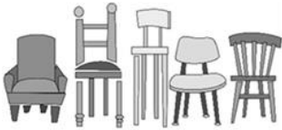
There's a Place for You!